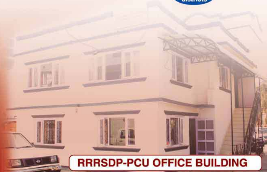
RRRSDP-PCU OFFICE BUILDING